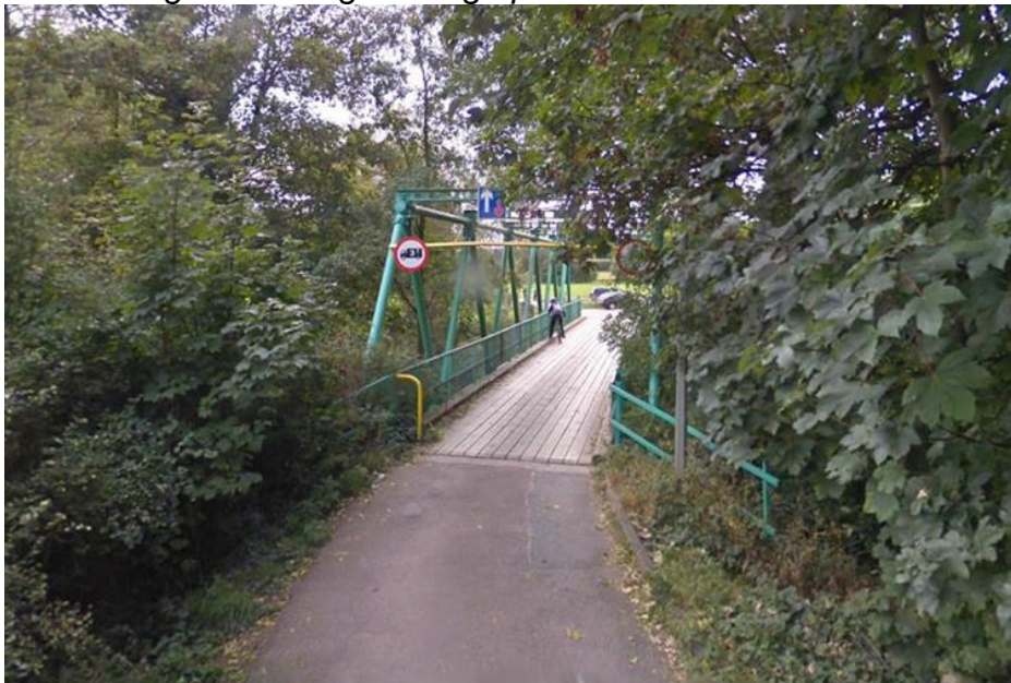
image of the Inglis Bridge prior to its closure to vehicles.

The Footpath was initially closed with an emergency closure notice dated 13th September 2024 but is now closed by temporary traffic regulation order for up to 6 months.